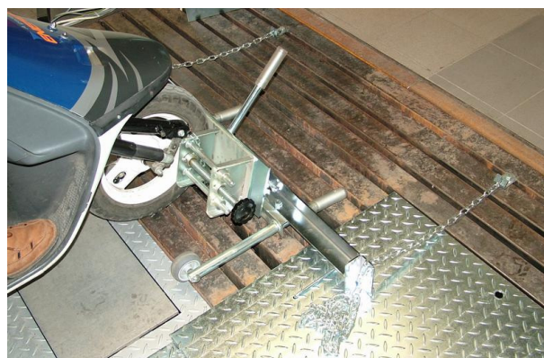
MBT in use

Actuation: manual Corrosion protection: galvanised